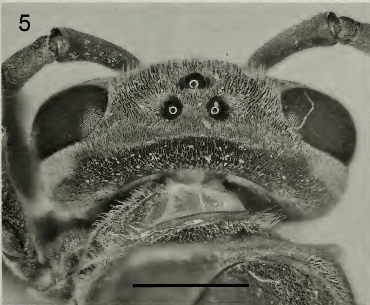
Figs 1-8. Continued.

arc with a black basal lip, dorsal third covered by lateral clypeal lobe. Mandible smooth, outer surface with a few long bristles. Mesosoma . Pronotum, scutum and